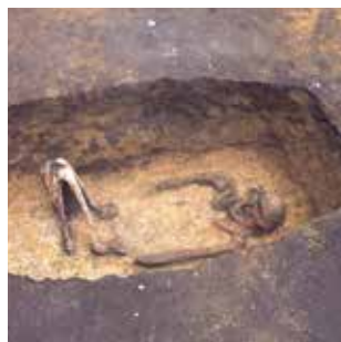
Human bone dyed reddish with pigments