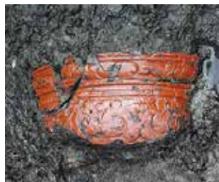
The condition of unearthed wooden lacquerware