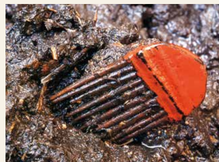
The condition of unearthed lacquer coated comb

A A dumping site was discovered at the vestige of wetland at Nakai Site. As ground water is abundant and remains didn't expose to air, nuts, bones, lacquerware remained without being rotten.