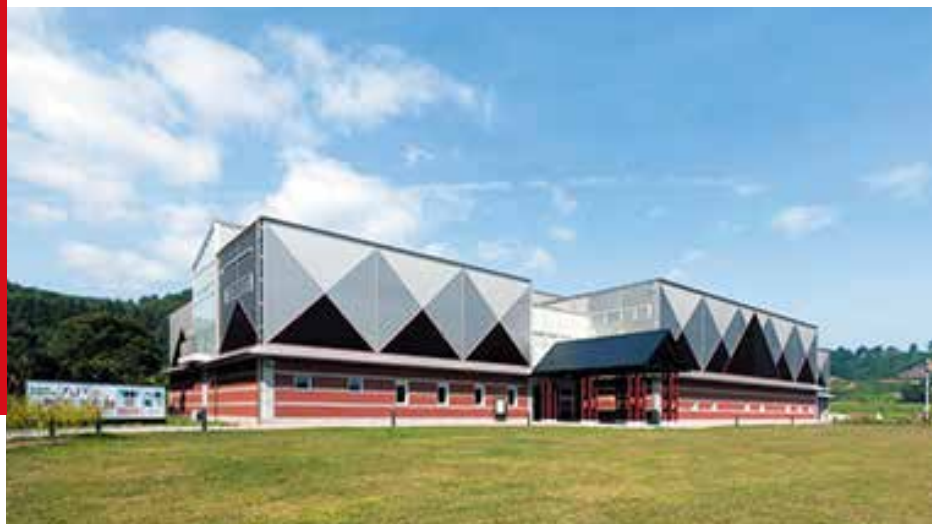
Korekawa Archaeological Institution (Korekawa Jomon Kan)

Hachinohe City/About 6,000-2,300 years ago Historical Site Designated in 1957 (Additionally designated in 2004 and 2013)