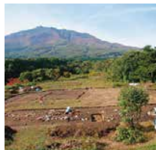
Excavating investigation scene