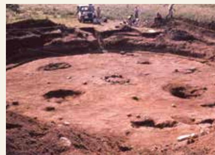
A large pit dwelling

A The pit dwelling is located about 100 meter to the southwest of the stone circle and there is hearth vestige surrounded by stones with about 1.4 meter diameter in the center. 4 large holes of pillar surrounding the hearth were discovered.