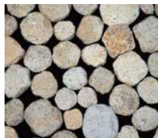
A disk-shaped stone article