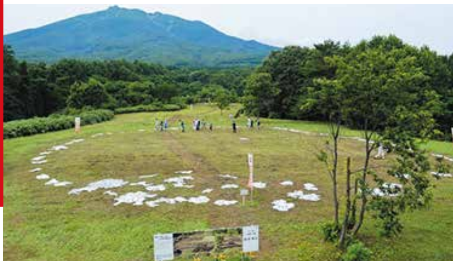
Current situation (Revived stone circle)

Hirosaki City/About 3,000 years ago Historical Site Designated in 2012