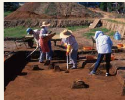
Scene of excavation

A It's considered that as there were no posthole and hollow in the space where people lived, the dwelling must have the structure without digging down the ground unlike a pit dwelling.