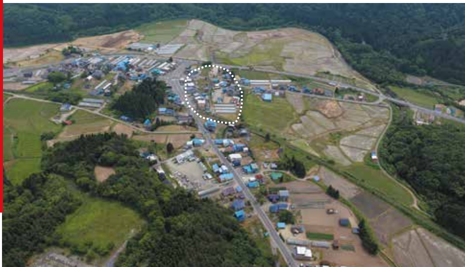
A view from the sky (The circular mark shows the location of the site)

Sotogahama Town/About 15,000 years ago Historical Site Designated in 2013