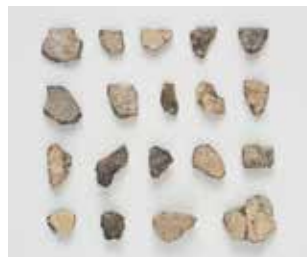
The oldest class clay pottery fragment in Japan