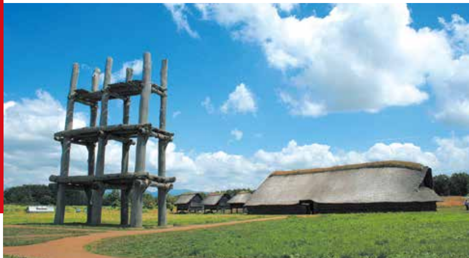
A large pillar building (Restored) and a large pit dwelling (Restored)

Aomori City/About 6,000-4,000 years ago Special Historical Site Designated in 2,000