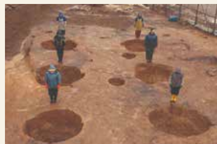
A pillar hole of the large pillar building (Sannai-Maruyama Site)

A The diameter of unearthed pillar hole is about 2 meter and its depth is more than 2 meter. A pillar of chestnut tree with about 1 meter diameter was discovered from the hole. It's considered from the soil analysis and existing chestnut trees investigation that it was a large building with nearly 20 meter height.