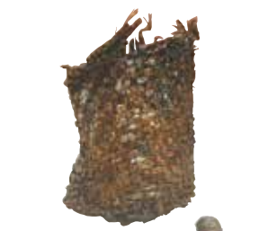
"Jomon Pochette" in which walnuts were put