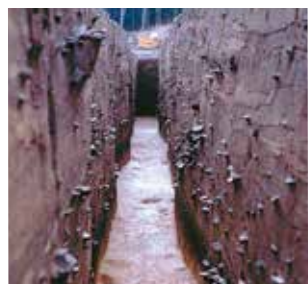
A pottery mound piled about 2.8 meter high